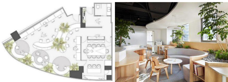
Fig. 2. Interior perspective (right) and plan (left) of office spaces [15].

According to numerous clinical evidence, living in such an environment, emotionally and biologically, can strengthen the internal nervous system and the immune system, especially in people suffering from diseases and health disorders [7]. Inside a room with a window overlooking a green area aids in the recovery process of hospitalized patients [6]. Also, plants and other manifestations of nature that are thoughtfully in the same room can play the same role and more. Thus, the biophilic bio-design can reduce stress and fatigue, lower systolic blood pressure and pulse rate, improve overall immune functions, cognitive and creativity, and regulate emotion and mood [8]. One of the architectural applying examples of the biophilia design was the hidden garden behind the concrete wall in office spaces, as in Fig. 2 , to permeate and integrate living nature, curved offices, daylight, air, plants, daylight, materials, and colors that flow into the interior design.