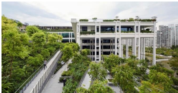
Fig. 1. Residential neighborhood design in Punggol [15].

toward the watercourse that integrate living nature, wide openings to communicate with nature, daylight, air, colors, plants, and green rooftops.