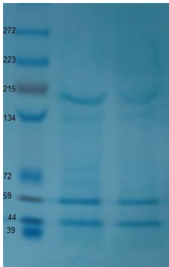
Figure 3. Protein profile of A. fragrantissima using SDS-PAGE.