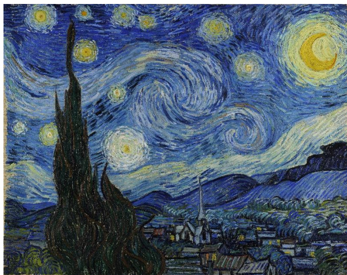
Fig. 2 Starry Night by Vincent Van Gogh

To close this section, it is noteworthy to emphasise that AI is not an independent entity detached from human minds. The definition of “Art” is the application of imagination and skill by human beings to produce designs that have emotional power or beauty [17]. ‘Edmond de Belamy’ followed an algorithm that is based on the hard work and creativity of human beings who judged it to be an artistic contribution [18]. "Architecture is an art, yet we rarely concentrate our attention on buildings as we do on plays, books, and paintings." [19]. Hence, the artistic nature of architecture demands the investigation of AI use in the concept generation phase just as it is required for the arts in general.