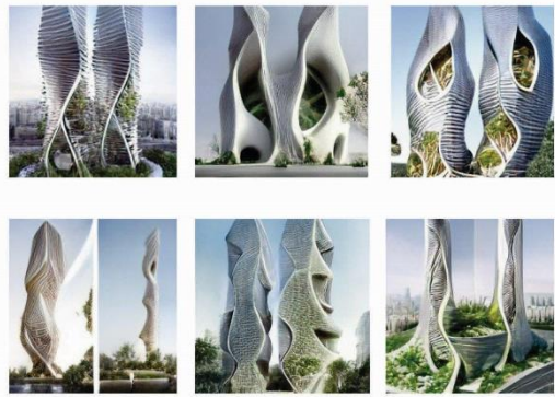
Fig. 4. (Top) Narrative and AI imagery produced by MidJourney (Bottom) Narrative and AI imagery produced by Craiyon.