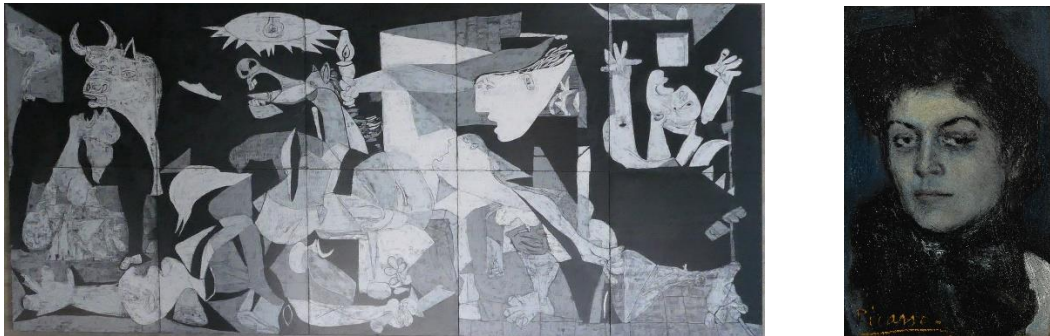
Fig. 1 (Left) Guernica © Moleskine, CC BY-NC-SA 4.0 (Right) (Picasso’s sister) Lola portrait © Gandalf’s Gallery, CC BY-NC-SA 2.0

Goodfellow et al. [8] proposed a framework that uses a machine learning (ML) algorithm known as a generative adversarial network (or GAN) to generate images. This method produced a portrait entitled ‘Edmond De Belamy’, which was sold for the same amount as a collection of Adolf Hitler’s original artwork painted before his horrendous war crimes [9]. This was mainly because the auction house justifiably advertised the portrait as the first painting generated by an algorithm sold in an auction. The question that poses itself is, can AI-generated art be judged as ‘true’ art? To answer this question this section refers to three main criteria that define true art, namely, sociability, creativity, and incentive. First, historians refer to sociability to clarify the bonds that are consciously or unconsciously initiated to form social relationships between people [10]. This intersubjective interpretation of reality is the main drive behind many works of Art, for example, Picasso’s painting Guernica was a highly appreciated work of art, despite that it was nonconformist with his early work (see Figure 1 ), mainly because of the association of the Spanish Civil War and the bombing of the Basque town. AI images still lack this element as it only relies upon a set of data and an algorithm to create an acceptable form of art.