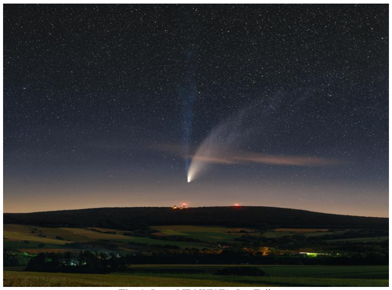
Fig. 1: Long NEOWISE's Ion Tail.